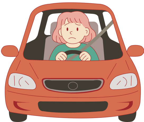
Can't drive safely